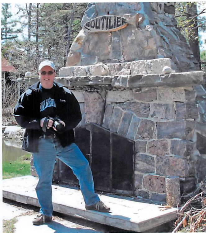
10 Sideroads Spring 2011